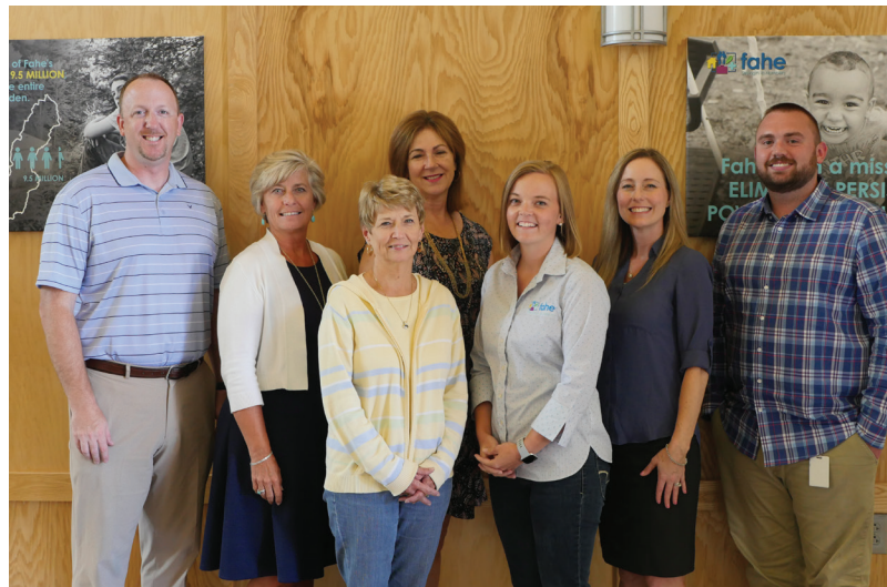
Fahe Strategic Programs staff.

Transformative Employment: The Appalachian Regional Commission (ARC) awarded Fahe $1M in POWER funding to expand the successful DV8 Kitchen reemployment